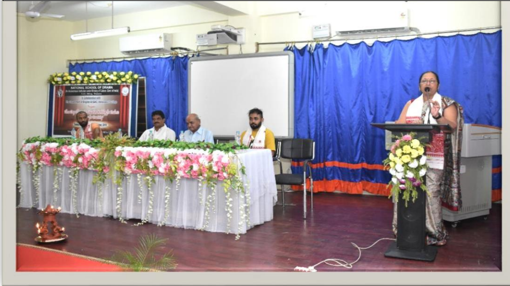
Photo: Three day Workshop on Theatre in Education, 09-09-2019 to 11-09-2019